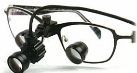
Attachment to TTL