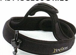
Soft headband (CHB01)