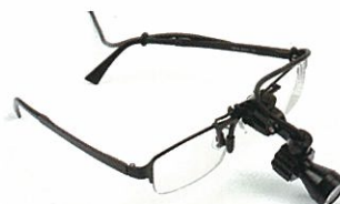
Attachment to common glasses