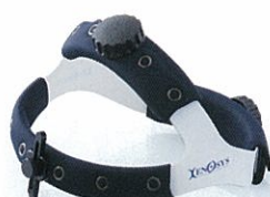
Hard headband (RH-B02)