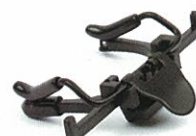
Universal adapterclip (UGC01)