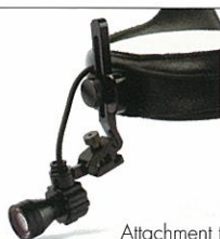
Attachment to headband